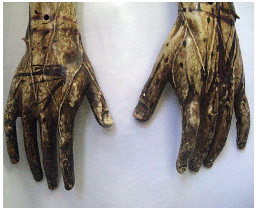
FIGURE 6. The Lord of The Three Falls. Anchoring orifice to hold up the hand; detail of wounds and veins on the left hand.