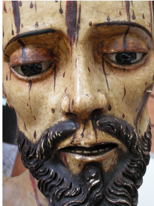
FIGURE 7. The Lord of The Three Falls. Insertion of eyes and teeth during the carving process.

I will not dwell on the mechanism's technology for the object of our study, since I am particularly interested in stressing how postizos were approached and considered at the time of the intervention (ENCRYM-INAH, 2010). Albeit the technique to manufacture the leather in the joints was explained and referred to as postizos , in the section regarding "material condition report" they are mentioned as part of the support, and their state of conservation is omitted. However, they are a clear example of the intention to make the sculpture mobile, which can only be achieved by placing different materials, fragments of skin, or stuffed cloth. Linked to this, the cords to highlight veins and glued cloths —named thus in the text,