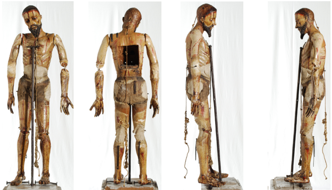
FIGURE 4. The Lord of the Three Falls. General views undressed before the process.

inside certain sections, which join them together while allowing movement, then covered with thin leather to integrate them, thus simulating Christ's skin. It also has iron nails holding down the cloths and cast iron tacks in the hips, face and behind the knees (Figure 5).